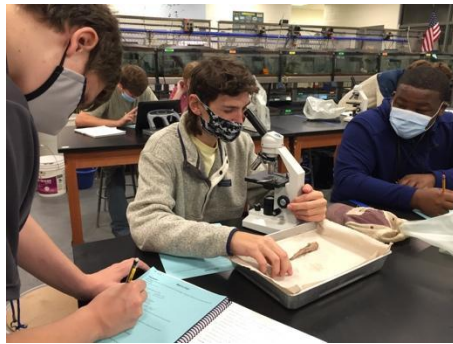
Students participating in lab comparing different aquatic species