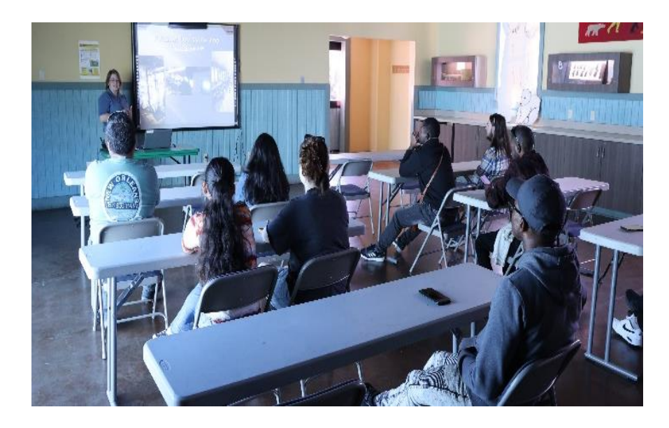
Subunit members at Louisville Zoo Water Department receiving training.