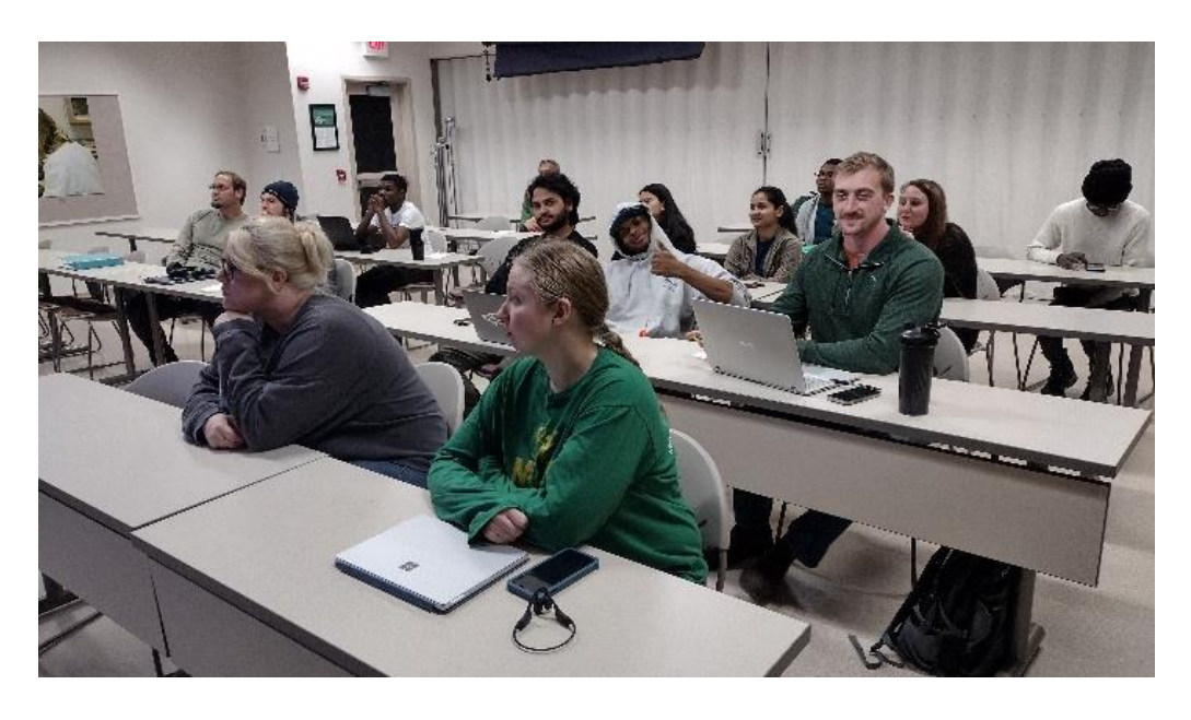
Subunit members during oyster presentation by a guest speaker