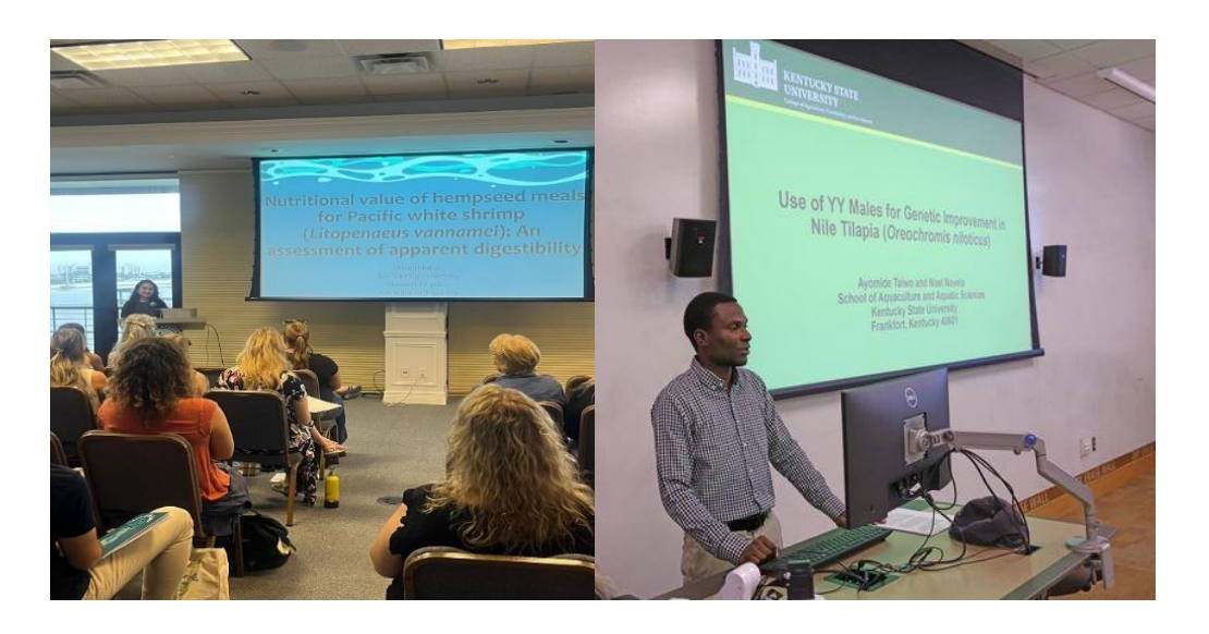
Subunit members participating at Women of the Water Conference 2023 (left) and Kentucky Academy of Science (right).