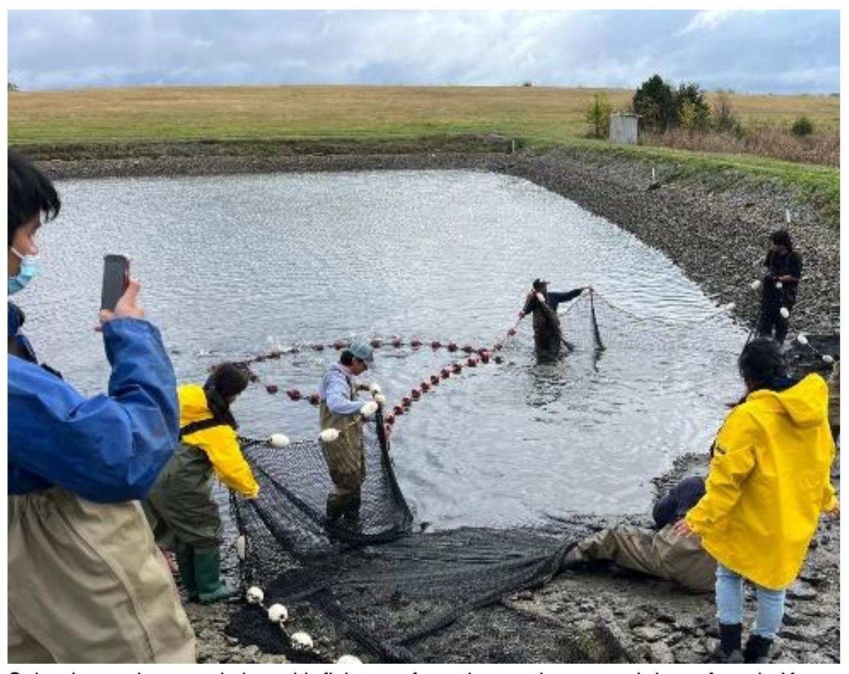
Subunit members assisting with fish transfer at largest largemouth bass farm in Kentucky.