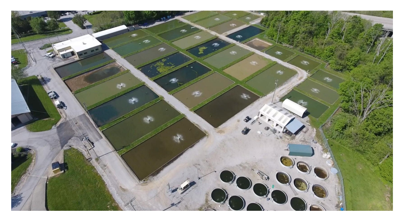
Illustration of drone technology application in aquaculture during seminar on drone technology.