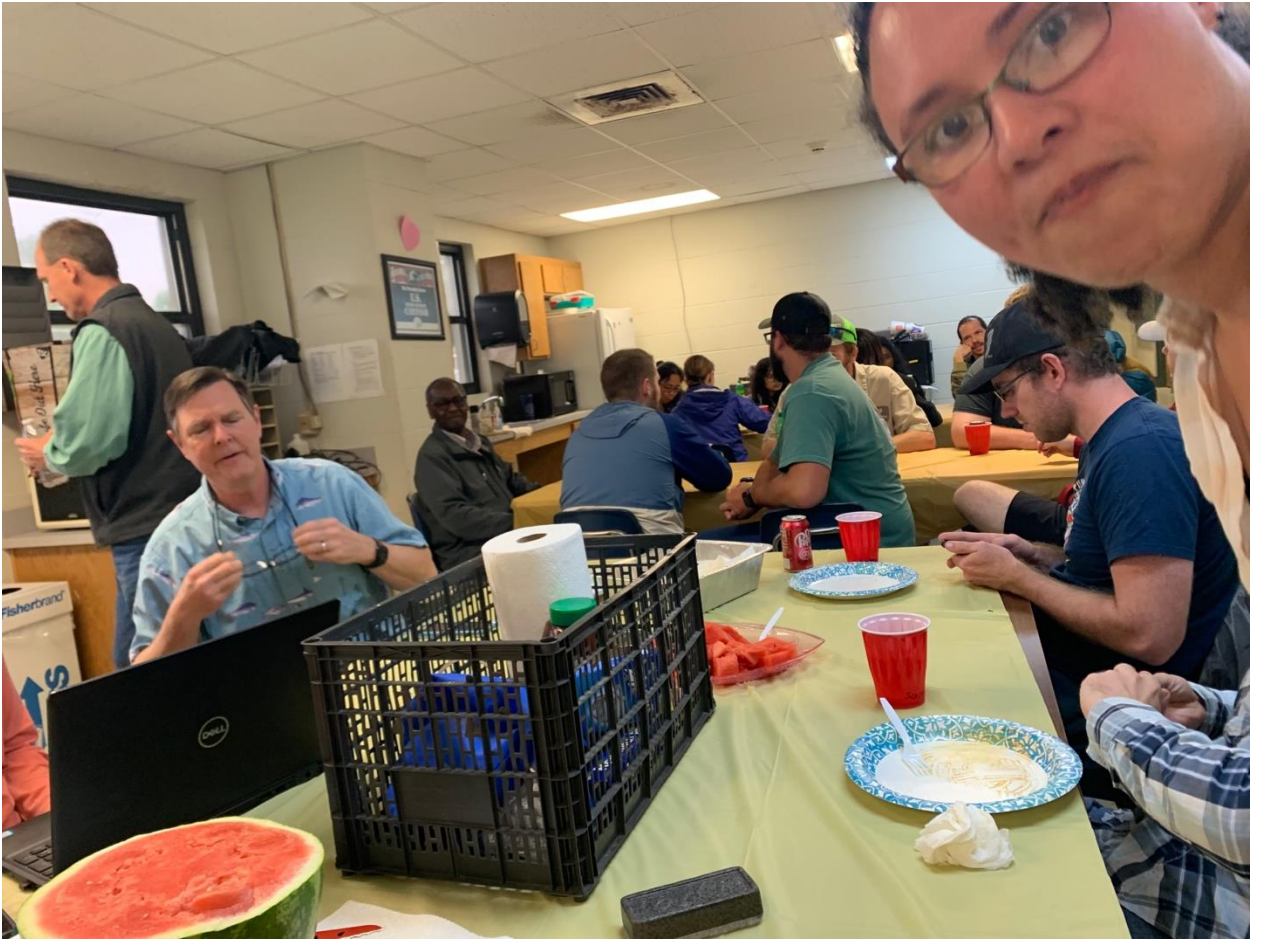
(Departmental fish fry hosted by faculty and student members.)