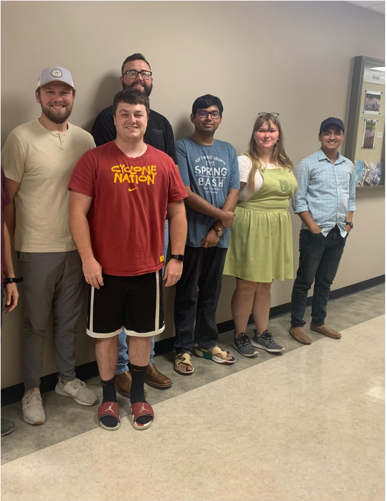
(Picture features all officers of the USAS Subunit and the AFS subunit at UAPB)